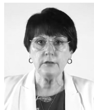
Dame Judith Hackitt

When the final report of Building a Safer Future was published in May 2018, I said that the system which covers construction product testing, information and marketing would require a map at least as complicated as the one we had developed to describe the regulatory system at that time. Although we were unable to extend the scope of that review to do such an exercise it was nonetheless clear that radical change was needed for Construction Products.